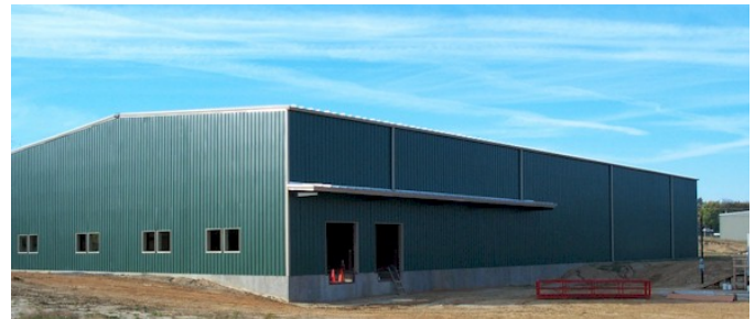
Troy Spec Building 20,000 square feet

Visit www.wtia.org for the latest listing of industrial buildings and acreage for sale and/or lease.