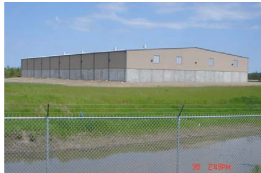
Port of Cates Landing FTZ Transit Shed/Warehouse 37,500 square feet

Visit www.wtia.org for the latest listing of industrial buildings and acreage for sale and/or lease.