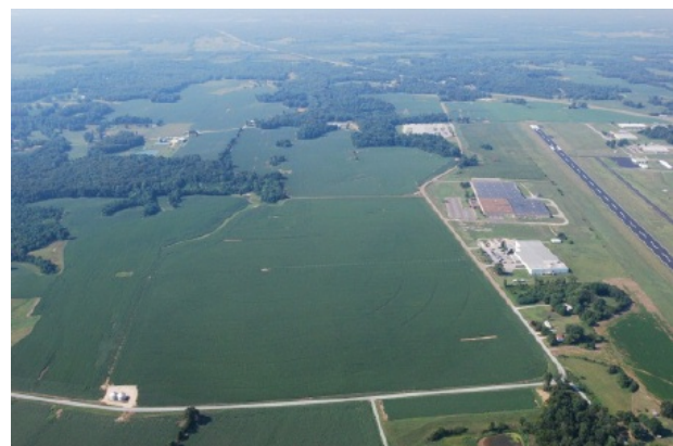
McKenzie/Airport Industrial Park 80 acres

Visit www.wtia.org for the latest listing of industrial buildings and acreage for sale and/or lease.