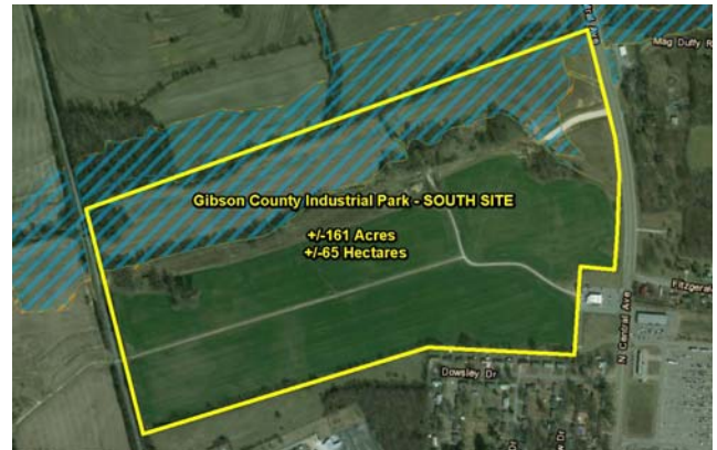
Gibson County Industrial Park – South Site 160 acres

Visit www.wtia.org for the latest listing of industrial buildings and acreage for sale and/or lease.