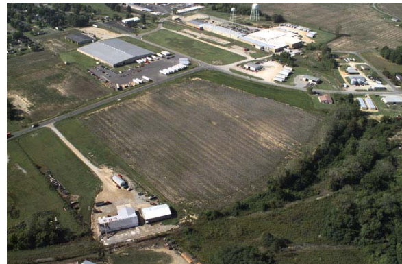
Halls Industrial Park 30 acres

Visit www.wtia.org for the latest listing of industrial buildings and acreage for sale and/or lease.