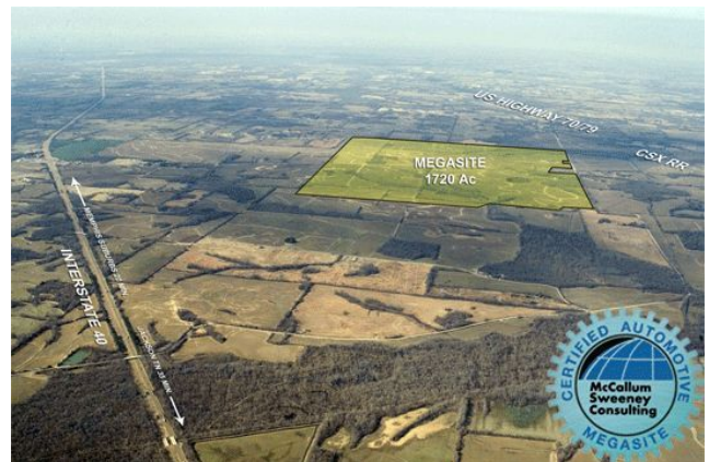
Memphis Regional Megasite 1,720 acres

Visit www.wtia.org for the latest listing of industrial buildings and acreage for sale and/or lease.