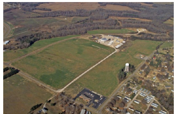
City of Bolivar Industrial Park 176 acres

Visit www.wtia.org for the latest listing of industrial buildings and acreage for sale and/or lease.