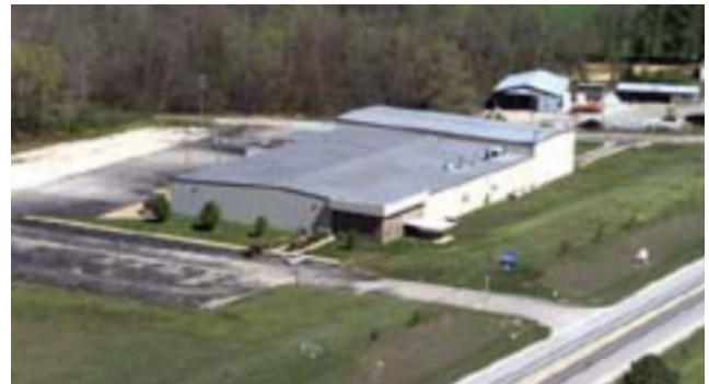
Fasco DC Building 42,500 square feet

Visit www.wtia.org for the latest listing of industrial buildings and acreage for sale and/or lease.