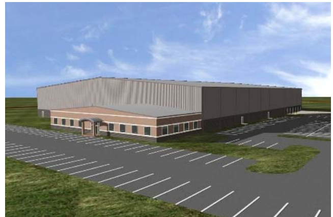
VIRTUAL Spec Building Any square footage requested

Visit www.wtia.org for the latest listing of industrial buildings and acreage for sale and/or lease.