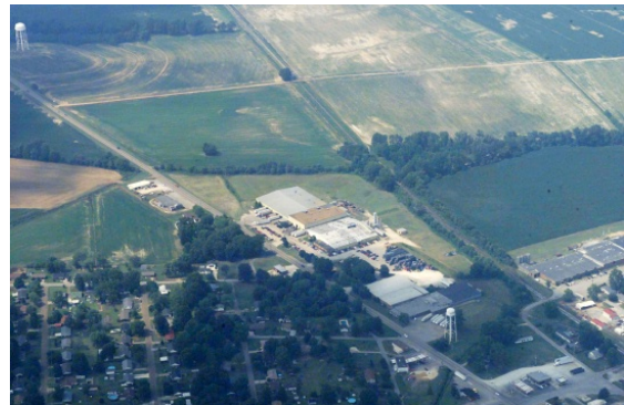
City of Kenton Industrial Site 30 acres

Visit www.wtia.org for the latest listing of industrial buildings and acreage for sale and/or lease.