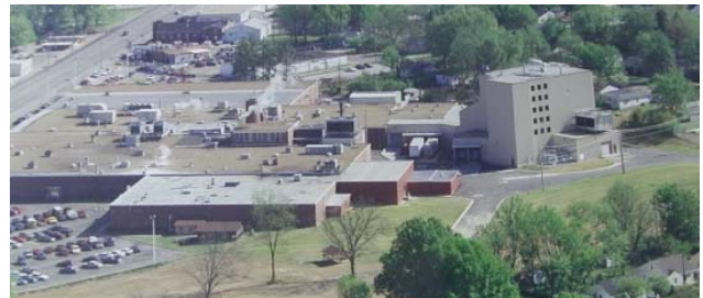
Wilson Sporting Goods Building 215,000 square feet

Visit www.wtia.org for the latest listing of industrial buildings and acreage for sale and/or lease.