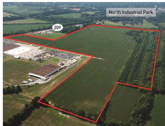
North Industrial Park in nearby Ripley 101 acres

Visit www.wtia.org for the latest listing of industrial buildings and acreage for sale and/or lease.