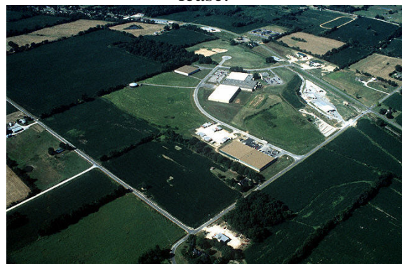
Dyer Industrial Park 60 acres

Visit www.wtia.org for the latest listing of industrial buildings and acreage for sale and/or lease.